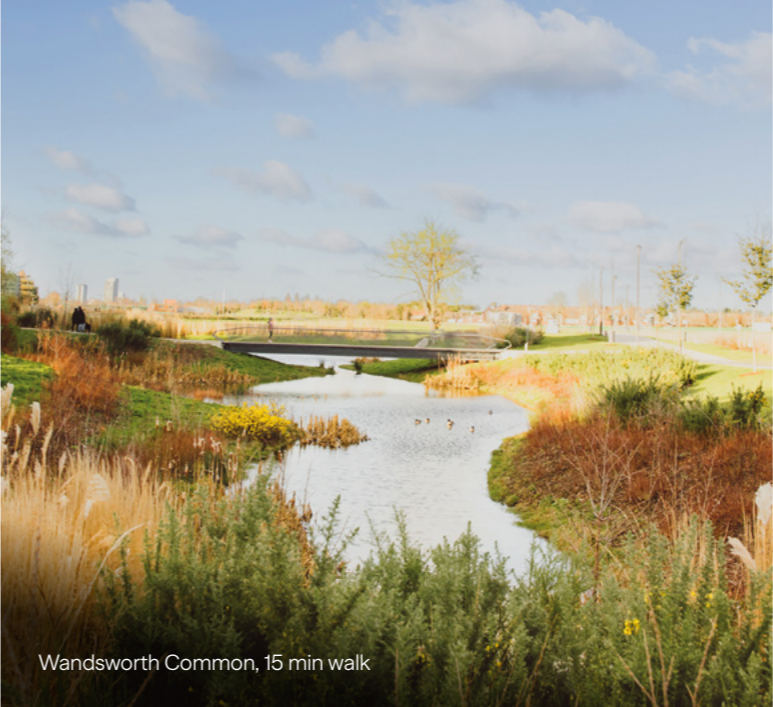
Wandsworth Common, 15 min walk