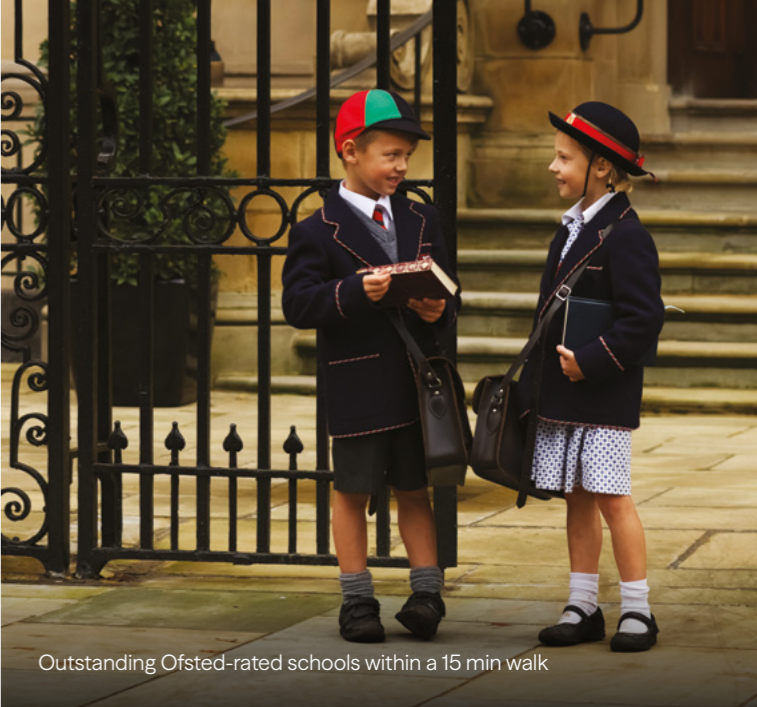
Outstanding Ofsted-rated schools within a 15 min walk