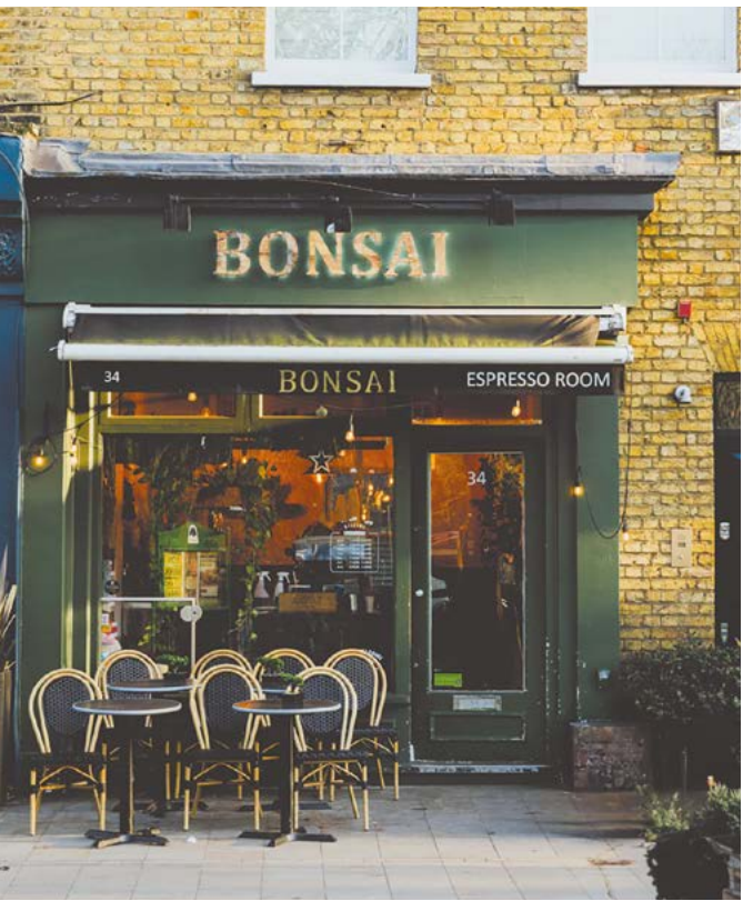
BONSAI ESPRESSO ROOM 12 MIN WALK