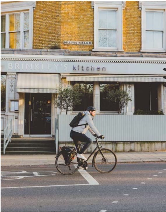
BRINKLEY'S KITCHEN 12 MIN WALK

The thriving brunch scene at Earlsfield is also noteworthy with plenty of cosy choices on Garratt Lane, including The Eclectic Collection for something unique and GAIL's Bakery for when you're meeting a larger group of friends.