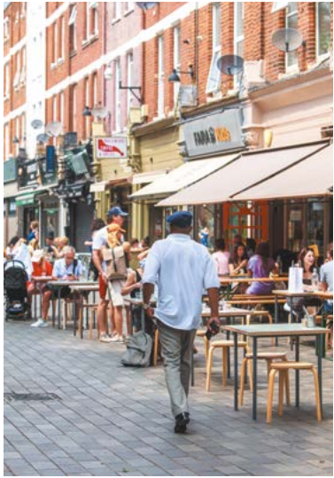
UPPER TOOTING ROAD 5 MIN CYCLE