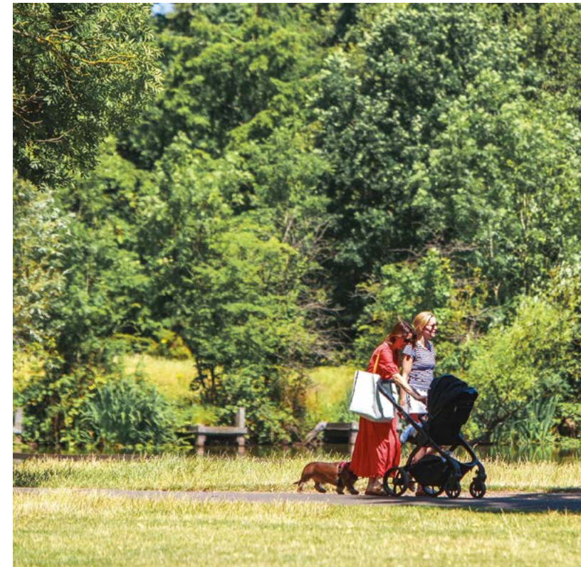
WANDSWORTH COMMON 5 MIN CYCLE