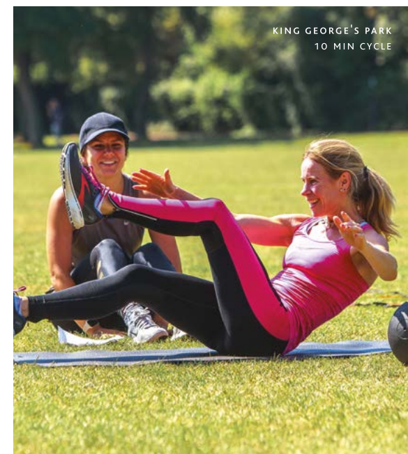
KING GEORGE'S PARK 10 MIN CYCLE

TIMES TAKEN FROM GOOGLE MAPS & CITYMAPPER.