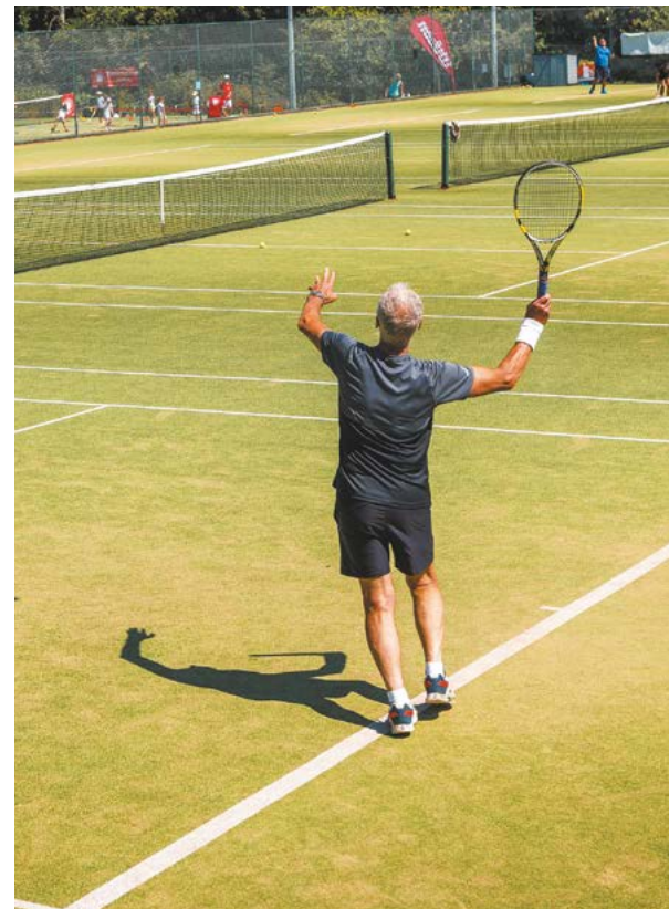
WIMBLEDON PARK TENNIS COURTS 12 MIN CYCLE