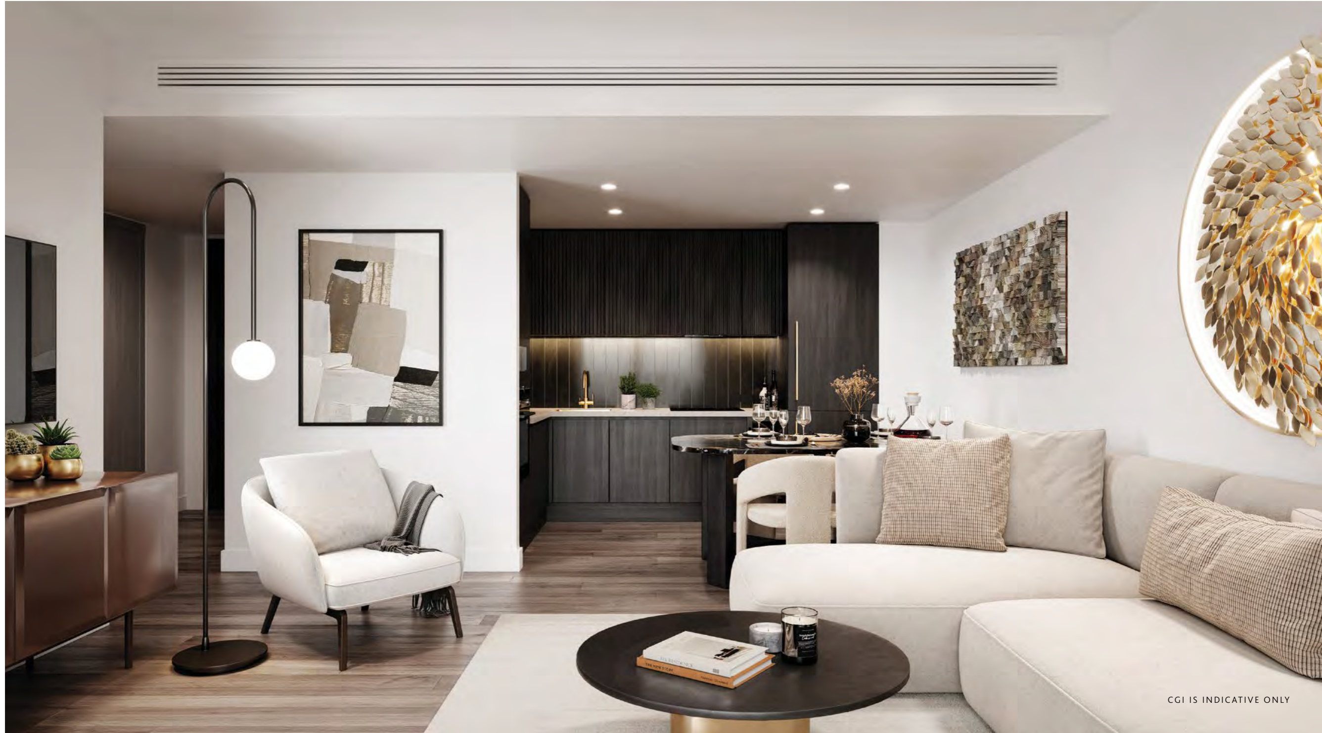
CGI IS INDICATIVE ONLY

London Square ensures a level of intricacy and detail in which you can feel the care and thought throughout each apartment.