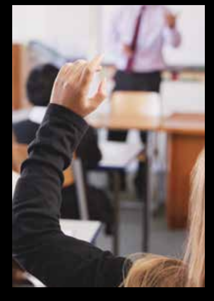
TOP-TIER SCHOOLS Several great nurseries and high-performing schools in the area.