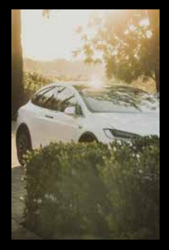
CAR PARKING To all homes<sup>*</sup>, plus EV charging. All local roads also provide residents with on street parking.