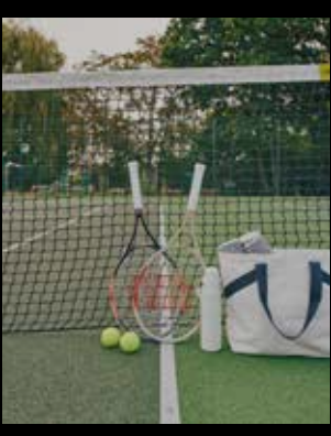
OUTDOOR ACTIVITIES Parks, playing fields and watersports all within easy reach.